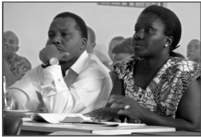
PASTORS MARRIAGE CONFERENCE