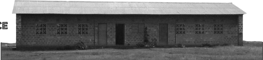
WISDOM COMMUNITY SCHOOL